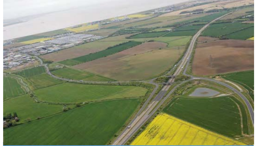
Town Deal offer

NELC committed to invest £15.2m into SHIIP in 2015.